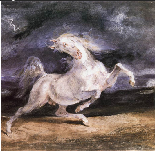
Horse Frightened by Lightning , 1824–1829 watercolor, white heightening, gum Arabic watercolor on paper, 94 x 126 in. Museum of Fine Arts, Budapest, Hungary