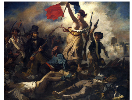
Liberty Leading the People , 1831 Louvre, Paris, France

The Romantic Movement was inspired in part by the ideas of Rousseau, who declared that "Man is born free, but is everywhere in chains!" Romanticism emerged from the desire for freedom – political freedom, freedom of thought, of feeling, of action, of worship, of speech, and of taste. Romantics believed that the path to freedom was through imagination rather than reason and functioned through feeling rather than through thinking. The movement was partly a reaction against the rigidity of Enlightenment thought. Delacroix was known as the Romantic Colorist because of his potent and imaginative use of color. His expressive brushstrokes and interest in capturing how light affects color inspired the Impressionist movement of the 19 th century.