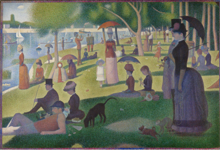
A Sunday on La Grande Jatte , 1884–1886 oil on canvas, 81 3/4 x 121 1/4 in Art Institute of Chicago, Chicago